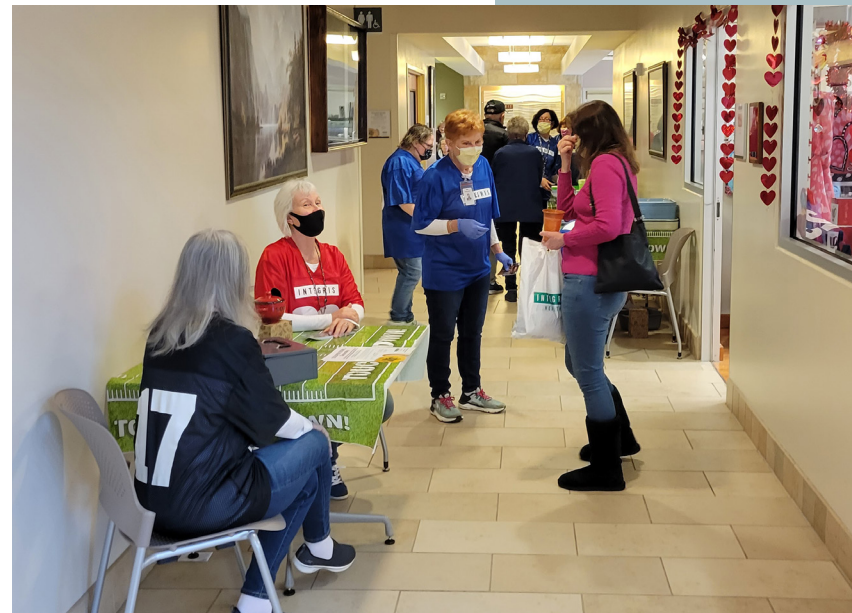
Souper Bowl Saturday, 2023