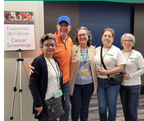
Hispanic Health Fair, 2023